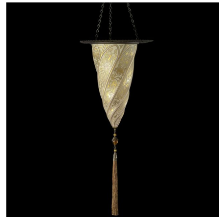
Shown in brass / gold classic

Discover the enduring elegance of the Cesendello Glass Ring Pendant, a contemporary reimagining of ancient sanctuary lamps with roots in Rome and Byzantium. Crafted with precision in Italy, this exquisite pendant features decorative glass, gracefully complemented by a distinctive decorative ring and a luxurious 11.5-inch tassel. Available in a stunning array of finishes including Gold Classic, Silver Classic, White Classic, Red Mosaic, and Gold Mosaic, the Cesendello Glass Ring Pendant offers exceptional versatility to harmonize with your interior design. Perfect for adding a touch of historical charm and sophisticated illumination to kitchen islands, hallways, or cozy reading nooks. Note: The overall height is not adjustable and must be specified to order. Minimum/Maximum Height: 34.63 in. / 41 in.