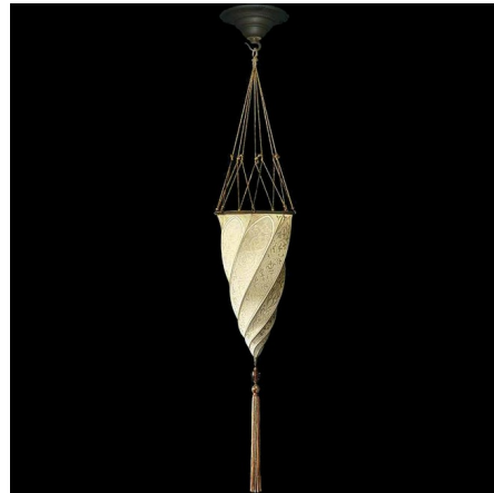
Shown in brass / ivory classic silk

COLOR . . . . . Ivory Classic Silk BODY FINISH . . . . . Brass WATTAGE . . . . . 25W DIMMER . . . . . Standard 120V DIMENSIONS . . . . . 6.75"W x 21.5"H x 38.625"D BULB NOT INCLUDED . . . . . 1 x B10/Candelabra (E12)/25W/120V Incandescent OTHER BULB OPTIONS . . . . . 1 x B10/Candelabra (E12)/120V LED