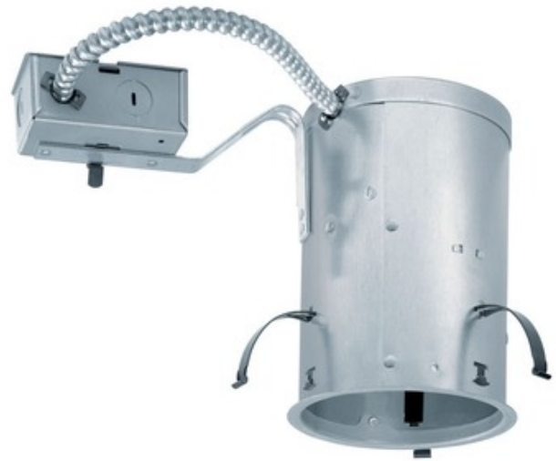
Shown in: Aluminum

IC20R 5 Inch IC Remodel Housing is an energy efficient sealed housing. IC remodel housing for remodel application where back side of ceiling is not accessible. Installs through an opening in the ceiling from below. Secured in place by factory installed remodel springs. Can be completely covered with insulation. When used with Air-Loc gasket (ALG5R), stops infiltration and ex-filtration of air, reducing heating and cooling costs. Trims shown with Air-Loc symbol do not require a gasket. One 120 volt, A19, BR30, PAR30, PAR20, R20, PAR30L or A15 medium base lamp or LED equivalent is required, but not included. Lamp type and wattage dependent upon housing/trim combination (see attached Juno manufacturer specification). Incandescent/halogen dimmable with a standard incandescent dimmer. Consult lamp manufacturer for dimmer compatibility when using an LED equivalent lamp. UL listed for through-branch wiring, damp locations and IP. Product thermally protected against improper use of lamps. Trims 210N, 211 and 212N are wet location approved for covered ceiling applications. Trims 215 and 216 are wet location approved for covered ceiling applications when used with outdoor rated lamps. 12.5 inch length x 5.9 inch width x 7.5 inch height. A complete fixture includes a housing and trim, sold separately.