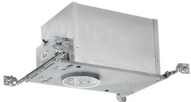
Shown in: Aluminum

IC44N 4 Inch Low Voltage Air Loc IC New Construction Housing is energy efficient with a sealed inner housing which does not require a separate ALG gasket. Air-Loc housing stops infiltration and exfiltration of air, reducing heating and cooling costs. Accommodates ceiling thickness up to 1 inch. Includes 120 volt to 12 volt 50VA thermally protected magnetic transformer mounted inside outer housing. One 12 volt, 50 watt GU5.3 MR16 halogen or LED equivalent lamp is required, but not included. May be dimmed using dimmers specifically designed for low voltage magnetic transformers. UL listed for through branch wiring, damp locations and IP. Trim 441, 4401, 4402 and 4481 are wet location approved for covered ceiling applications. 18.5 inch length x 9.1 inch width x 7.6 inch height. A complete fixture includes a housing and trim, sold separately.