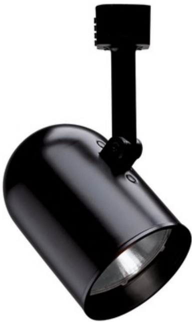
Shown in: Black

R500 PAR30 Round Back Cylinder Track Fixture features a drawn steel housing with polycarbonate stem in White or Black finish. 90 degree vertical aiming capability and 358 degree rotation. Copper alloy contacts provide precise spring action. True, positive electrical ground. On/off switch included. Patented embossed polarity arrows on bottom of adapter. Spring-loaded locking latch with embossed polarity arrows secures track light to track. Pull-up contact to up position for use on two-circuit track. One 50 watt, 120 volt PAR20 or R20 medium base lamp is required, but not included. UL listed. Compatible with Juno Lighting Trac-Lites, Trac-Master 1-circuit and Trac-Master 2-circuit 120 volt line voltage track systems.