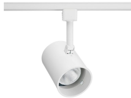
Shown in white / white baffle