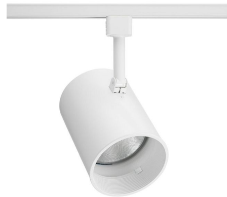
Shown in white / white baffle