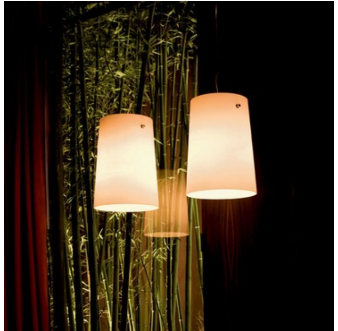
Shown in: Chrome / White

Sera S1 suspension features a blown glass diffuser in a slightly flared shape, suspended by three wires from an arrow v-angled flat canopy. Cable artfully curves downward from its own separate canopy. Shade available in Clear Crystal, Opal White, or Mirror finished in Chrome, in three sizes. One 150 Watt 120 Volt A21 type medium base bulb is required, but not included. General light distribution. Dimmable. Designed by Mengotti. Made in Italy. UL and CUL listed.