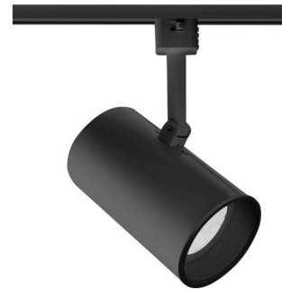
Shown in black / black baffle

T313 PAR20 Flat Back Cylinder Track Fixture features a simple, sleek design that remains a very popular track light design. Deep lamp shielding reduces glare. Drawn steel housing with polycarbonate stem. Features 90 degree vertical aiming capability and 358 degree rotation. Finish available in Black with a black baffle or White with a white baffle. One 35-50 watt PAR20 or 27-50 watt R20, 120 volt intermediate base bulb is required, but not included. Incandescent/halogen bulb option dimmable with a standard incandescent dimmer. Consult with bulb manufacturer for dimmer compatibility when using LED option. Optional optical accessories available, sold separately. UL listed. Compatible with Juno Lighting Trac-Lites 1-circuit and Trac-Master 1-circuit and 2-circuit 120 volt line voltage track systems.