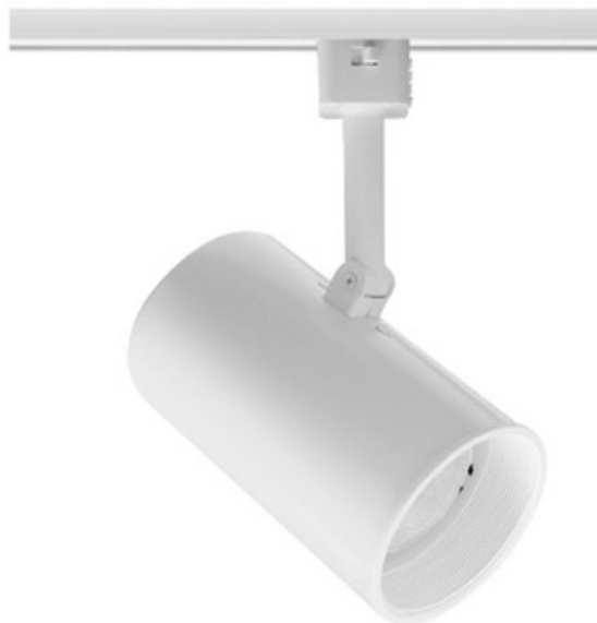
Shown in: White/ White Baffle

T313 PAR20 Flat Back Cylinder Track Fixture features a simple, sleek design that remains a very popular track light design. Deep lamp shielding reduces glare. Drawn steel housing with polycarbonate stem. Features 90 degree vertical aiming capability and 358 degree rotation. Finish available in Black with a black baffle or White with a white baffle. One 35-50 watt PAR20 or 27-50 watt R20, 120 volt intermediate base bulb is required, but not included. Incandescent/halogen bulb option dimmable with a standard incandescent dimmer. Consult with bulb manufacturer for dimmer compatibility when using LED option. Optional optical accessories available, sold separately. UL listed. Compatible with Juno Lighting Trac-Lites 1-circuit and Trac-Master 1-circuit and 2-circuit 120 volt line voltage track systems.