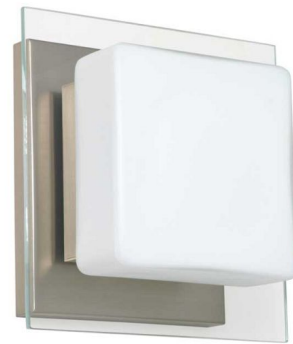
Shown in satin nickel / clear

The Alex Wall Light features assorted glass trim options with a Bronze or Satin Nickel finish. Also comes with no glass trim. 50 watt, 120 volt JCD G9 base bulbs are required but not included. With Glass: 6.325 inch width x 6.325 inch height x 3.375 inch depth. Without Glass: 4.375 inch width x 4.375 inch height x 3.25 inch depth. ADA compliant. UL listed. Suitable for interior damp locations.