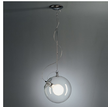
Shown in chrome / clear

COLOR . . . . . Clear BODY FINISH . . . . . Chrome WATTAGE . . . . . 150W DIMMER . . . . . Standard 120V DIMENSIONS . . . . . 61"L x 11.75"W x 21.65"H BULB NOT INCLUDED . . . . . 1 x G40/Medium (E26)/150W/120V Incandescent COUNTRY OF ORIGIN . . . . . Italy