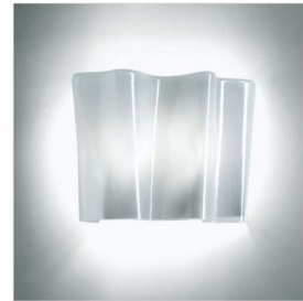
Shown in gray / white

Introduce a touch of organic elegance to your walls with the Logico Single Wall Light, a fixture that redefines how light interacts with space. This exquisite sconce features a hand-blown, organically shaped satin glass diffuser that creates a mesmerizing illusion, appearing to float effortlessly and casting a soft, inviting glow. Available in timeless Milky White, the glass is beautifully contrasted by a sturdy die-cast frame in a pale Grey finish, ensuring a sleek and integrated appearance against your wall. The Logico Single Wall Light is UL listed for safety and proudly made in Italy, a testament to its superior craftsmanship and enduring design. Customers frequently highlight its unique sculptural form and beautiful ambient light, praising its ability to add depth and sophistication to any room. Perfect for hallways, living rooms, bedrooms, or dining areas, this fixture offers an architectural and contemporary aesthetic, transforming your walls into canvases of light and shadow with its subtle yet impactful presence.