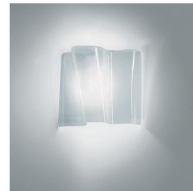
Shown in gray / white

COLOR . . . . . White BODY FINISH . . . . . Gray WATTAGE . . . . . 75W DIMMER . . . . . Standard 120V DIMENSIONS . . . . . 9.9"W x 8.75"H x 4"D BULB NOT INCLUDED . . . . . 1 x A19/Medium (E26)/75W/120V Incandescent OTHER BULB OPTIONS . . . . . 1 x A19/Medium (E26)/120V LED COUNTRY OF ORIGIN . . . . . Italy