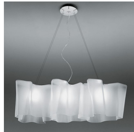
Shown in gray / milky white

PRODUCT DIMENSIONS . . . . . Canopy: 7.125" diameter