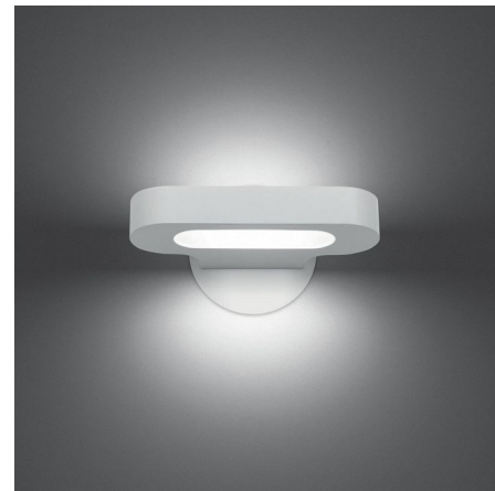
Shown in white

COLOR N/A BODY FINISH White WATTAGE 150W DIMMER Standard 120V DIMENSIONS 8.25"W x 1.75"H x 4"D BULB INCLUDED 1 x T3/R7s (RSC)/150W/120V Halogen COUNTRY OF ORIGIN Italy