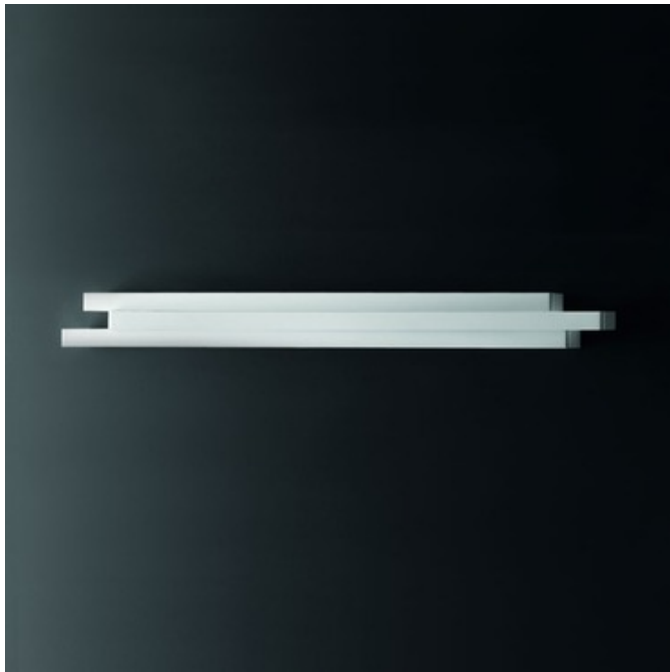
Shown in: White

The Escape ADA Wall Light is made up of elements horizontally arranged and parallel to each other. Made of aluminum in painted White finish with an opaline methacrylate diffuser. Available in two sizes and with LED or fluorescent lamp options. ETL listed. ADA compliant.