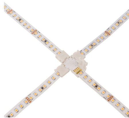
Shown in white

Snap and Light X Connector joins and conducts power to four sections of White or RGB Soft Strip into an X-shape. The do-it-yourself accessories allow cutting and rejoining of Stomp Strip at any joint. The accessories attach to the end of Soft Strip, secure the strip and snap shut to lock it into place. Designed for use with PureEdge Lighting Snap & Light Stomp Strip.