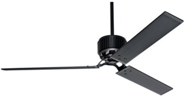
Shown in: Matte Black

HFC 72 inch Ceiling Fan is designed to significantly improve air circulation in large spaces like vaulted living rooms, pole barns, and industrial buildings. The large blades do the work - it turns at lower speeds than a standard ceiling fan yet moves much more air because of its long 72 inch aluminum blade span. With this fan, you get the air circulation you need to regulate room temperature and keep heating costs down without the wind and breeze created by smaller fans. As a special feature the HFC-72 includes 6 blades and can be installed as a 3 or 6 blade fan. The fan is also damp rated for use in covered porches, patios, and sunrooms. Available in a Matte Black motor with Black aluminum blades or Matte White with Matte White aluminum blades. Includes 3 speed stepped wall control and 11 inch downrod. CFM: 8926. Airflow Efficiency: 92. Electricity Use: 97 watts. Rated for damp locations. 72 inch width x 21 inch height. ETL listed, damp locations.