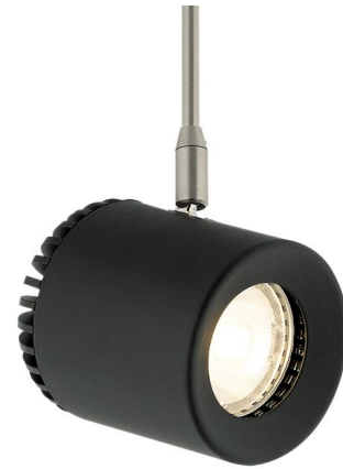
Shown in black / satin nickel