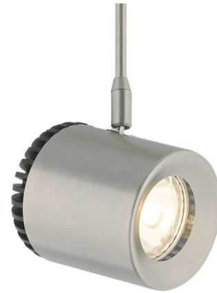
Shown in satin nickel / satin nickel