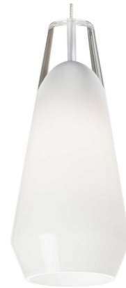
Shown in satin nickel / white

LAMP LIFE . . . . . 25000 hours COLOR RENDERING . . . . . 90 CRI LAMP COLOR . . . . . 3000K LUMENS/WATT . . . . . 37.50 LUMINOUS FLUX . . . . . 300 lumens