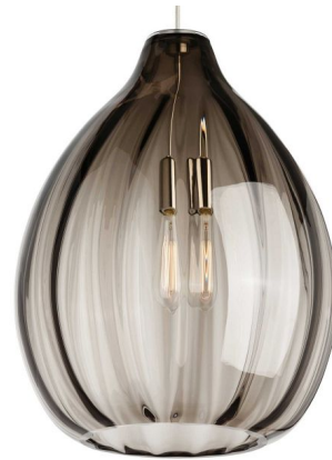
Shown in satin nickel / smoke

Harper Pendant is a large scale glass pendant featuring a classic bulb shape with organic texture handcrafted by highly skilled Polish artisans. Glass shade is available in three colors with three finish options. Includes a 4.5in canopy. Note: Not all options are available.