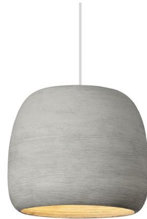
Shown in concrete

Karam Pendant is made entirely of ceramic material, with the inner and outer walls of each over-sized shade textured and painted by hand to create the rough and inherently unique appearance. Shade in Black with Black cord and canopy or Concrete with White cord and canopy. Available in two sizes and two lamp options. Small option includes 6 foot field-cutable cable. Large option includes 12 foot field-cutable cable. ETL listed. LED Title 20/24 compliant.