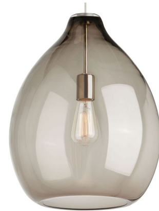
Shown in satin nickel / smoke

Quinton Pendant is a large scale glass pendant with an organic bulb shape hand blown by highly skilled artisans in Poland. Finish in Black with Black cloth cord or Satin Nickel with Satin Nickel cloth cord. Includes six feet of field-cuttable suspension cable and a 4.5 inch round flush mount canopy. Note: Natural Brass finish available with clear shade only.