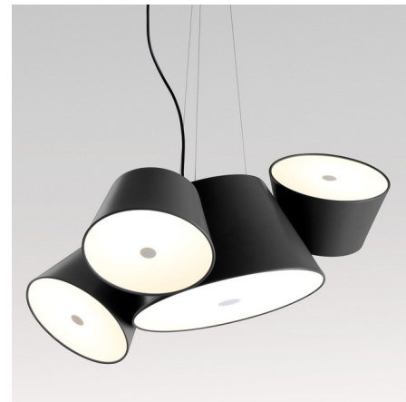
Shown in black central shade / black satellite shades

The Tam Tam Pendant is a new perception in the world of lamps, which extols repetitiveness by focusing on the archetypal lampshade: light sources pointed in different directions, geometrically arranged to invoke a feeling of organized chaos. It consists of a central shade made of Semi Matte lacquered aluminum in Black or Off White with three or five Semi Matte satellite shades in a variety of different colors. The outer satellite shades can be rotated 360 degrees by means of a swivel mechanism. Opalescent methacrylate bottom diffusers soften the light.