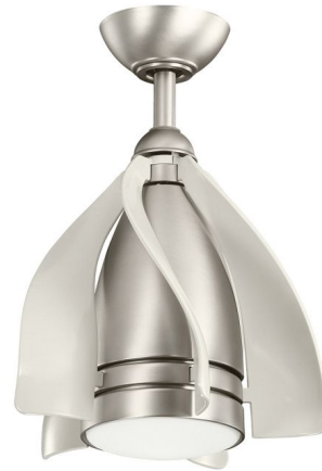
Shown in brushed nickel / champagne

COLOR RENDERING . . . . . 80 CRI LAMP COLOR . . . . . 3000K LUMENS/WATT . . . . . 94.12 LUMINOUS FLUX . . . . . 1600 lumens