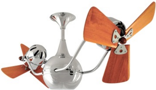
Shown in: Chrome / Mahogany

The Matthews-Gerbar Vent Bettina Wood Damp Ceiling Fan is thoughtfully designed with its arms gently upward curving. The fan offers fluid lines and quiet axial rotation. The motor heads can be infinitely positioned in 180-degree arcs for optimum air movement. Available in Brushed Nickel, or Chrome, all with Mahogany wood blades. Features a 16 inch blade span and 19 degree blade pitch. Includes one 10 inch downrod and a 3 speed Decora-style wall control in White. UL listed for Damp Locations. Limited lifetime warranty. Additional downrod lengths and vaulted ceiling canopy sold separately.