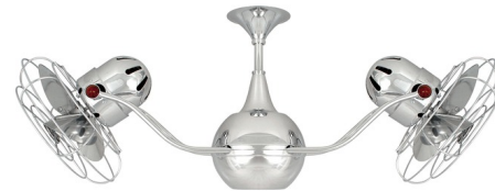
Shown in chrome

The Matthews-Gerbar Vent Bettina Metal Damp Ceiling Fan is thoughtfully designed with its arms gently upward curving. The fan offers fluid lines and quiet axial rotation. The motor heads can be infinitely positioned in 180-degree arcs for optimum air movement. Available in Brushed Nickel, or Chrome with decorative cages covering the metal blades for safety. Features a 16 inch blade span and 19 degree blade pitch. Includes one 10 inch downrod and a 3 speed Decora-style wall control in white. UL listed for Damp Locations. Limited lifetime warranty. Additional downrod lengths and vaulted ceiling canopy sold separately.