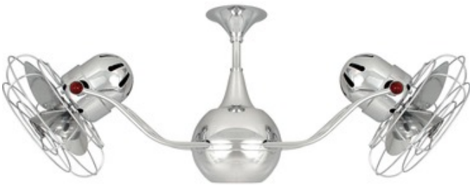
Shown in: Chrome

The Matthews-Gerbar Vent Bettina Metal Damp Ceiling Fan is thoughtfully designed with its arms gently upward curving. The fan offers fluid lines and quiet axial rotation. The motor heads can be infinitely positioned in 180-degree arcs for optimum air movement. Available in Brushed Nickel, or Chrome with decorative cages covering the metal blades for safety. Features a 16 inch blade span and 19 degree blade pitch. Includes one 10 inch downrod and a 3 speed Decora-style wall control in white. UL listed for Damp Locations. Limited lifetime warranty. Additional downrod lengths and vaulted ceiling canopy sold separately.