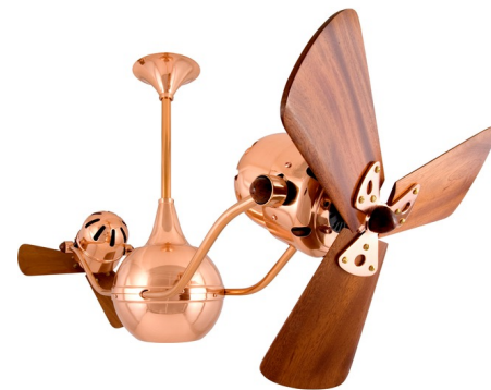
Shown in polished copper / mahogany tone

The Matthews-Gerbar Vent Bettina Wood Ceiling Fan brings fluid lines, gently curving arms and quiet rotation to your space. The fan heads can be infinitely positioned in 180 degree arcs for optimum air movement. The greater the angles of the motors to the horizontal support rods, up or down, the faster the axial rotation. A slow, controlled axial rotation is achieved by both fan head position and fan blade speed. The 360 degree rotation can circulate heat and air condition more effectively than traditional fans. Available in a variety of finishes with solid, ecologically harvested Brazilian Mahogany blades. Features a 19 degree blade pitch and 16 inch diameter per head. Includes a flat ceiling canopy, one 10 inch downrod, and a 3 speed Decora-style wall control in White. UL and cUL listed. Limited lifetime warranty. Additional downrod lengths and vaulted ceiling canopy sold separately.