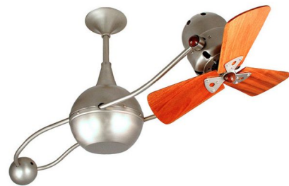
Shown in brushed nickel / mahogany tone

The Matthews-Gerbar Brisa 2000 Wood Damp Ceiling Fan resembles a satellite orbiting a planet, the lunar counterweight gently revolving about its spherical gear housing. The motor head can be infinitely positioned in a 180-degree arc for optimum air movement. Available in Chrome or Brushed Nickel all with Mahogany wood blades. Features a 16 inch blade span and 19 degree pitch. Includes one 10 inch downrod, and a 3 speed Decora-style wall control in White. UL listed for Damp Locations. Limited lifetime warranty. Additional downrod lengths and vaulted ceiling canopy sold separately.