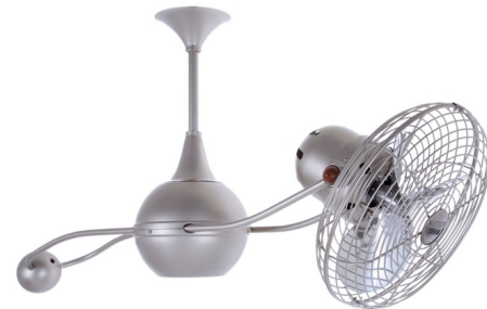
Shown in brushed nickel

BLADE COLOR N/A BODY FINISH Brushed Nickel WATTAGE N/A DIMMER N/A DIMENSIONS 39"W x 20"H BULB N/A COUNTRY OF ORIGIN Brazil