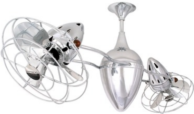
Shown in: Chrome

The Matthews-Gerbar Ar Ruthiane Metal Damp Ceiling Fan features a unique hourglass support arms grasp bullet-shaped motor housings which rotate about its teardrop center. The motor heads can be infinitely positioned in 180-degree arcs for optimum air movement. Available in Bronze, Black, Brushed Nickel, or Polished Copper with guards covering the metal blades. Features a 16 inch blade span and 31 degree blade pitch. Includes one 10 inch downrod and a 3 speed Decora-style wall control in White. UL listed for Damp Locations. Limited lifetime warranty. Additional downrod lengths and vaulted ceiling canopy sold separately.