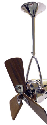
Shown in chrome / mahogany tone

The Matthews-Gerber Jarold Directional Wood Damp Ceiling Fan is unique and versatile and can be infinitely positioned in a 180 degree arc to provide maximum, directional airflow. Hang in front of HVAC ducts to increase the efficiency of the heating, ventilation, or air conditioning of any room. Available in Chrome or Brushed Nickel all with Mahogany wood blades. Features a 16 inch blade span and 19 degree pitch. Includes one 10 inch downrod and a 3 speed Decora-style wall control in White. UL listed for Damp Locations. Limited lifetime warranty.