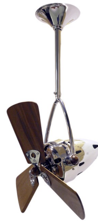
Shown in chrome / mahogany tone

The Matthews-Gerbar Jarold Directional Wood Damp Ceiling Fan is unique and versatile and can be infinitely positioned in a 180 degree arc to provide maximum, directional airflow. Hang in front of HVAC ducts to increase the efficiency of the heating, ventilation, or air conditioning of any room. Available in Chrome or Brushed Nickel all with Mahogany wood blades. Features a 16 inch blade span and 19 degree pitch. Includes one 10 inch downrod and a 3 speed Decora-style wall control in White. UL listed for Damp Locations. Limited lifetime warranty.