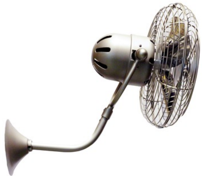
Shown in: Brushed Nickel

Michelle Parede Damp Wall Mounted Fan can be infinitely positioned vertically and horizontally across 180 degree arcs to provide maximum directional airflow. It can be mounted in small, awkward spaces or in front of HVAC ducts to increase the efficiency of the heating, ventilation, or air conditioning of any room. Constructed of cast aluminum, heavy spun and stamped steel. Available in Brushed Nickel or Chrome with guards covering the metal blades. Features a 16 inch blade span and 31 degree pitch. Product Airflow of 2497 cubic feet per minute, 109 watts of electrical use, and an airflow efficiency of 23 cubic feet per minute per watt. UL listed for Damp Locations. Limited lifetime warranty. 13 inch width x 20 inch height x 16 inch depth.