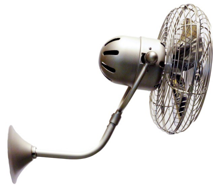
Shown in brushed nickel

Michelle Parede Damp Wall Mounted Fan can be infinitely positioned vertically and horizontally across 180 degree arcs to provide maximum directional airflow. It can be mounted in small, awkward spaces or in front of HVAC ducts to increase the efficiency of the heating, ventilation, or air conditioning of any room. Constructed of cast aluminum, heavy spun and stamped steel. Available in Brushed Nickel or Chrome with guards covering the metal blades. Features a 16 inch blade span and 31 degree pitch. Product Airflow of 2497 cubic feet per minute, 109 watts of electrical use, and an airflow efficiency of 23 cubic feet per minute per watt. UL listed for Damp Locations. Limited lifetime warranty. 13 inch width x 20 inch height x 16 inch depth.