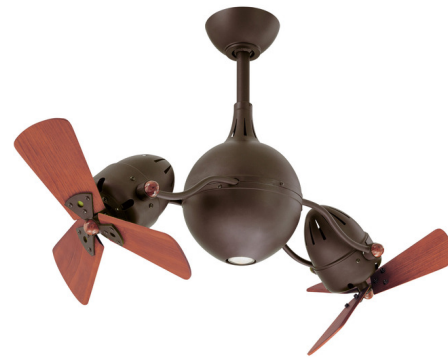
Shown in textured bronze / mahogany tone