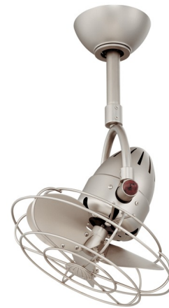
Shown in brushed nickel

The Atlas Fan Diane Metal Ceiling Fan is an oscillating directional fan that provides maximum, multi-directional airflow. Designed to be hung in small, awkward spaces or in front of HVAC ducts to make more efficient the heating, ventilation, or air conditioning of any room. AC motor construction of cast aluminum and heavy stamped steel in Polished Chrome, Matte Black Brushed Nickel or Textured Bronze finish with a decorative cage covering the metal blades for safety. Features a 13 inch blade span and 31 degree pitch. 90 degree forward and reverse sweeping oscillating function. Includes a vaulted ceiling canopy for up to 29 degrees, 10 inch downrod, and a 3-speed RF remote control in Black. ETL listed. Suitable for damp locations. Limited lifetime warranty.