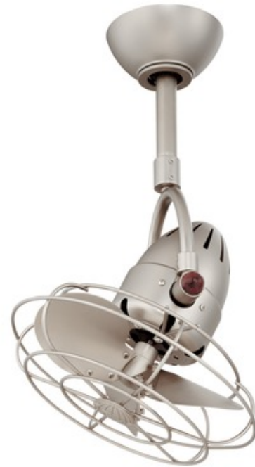
Shown in: Brushed Nickel

The Atlas Fan Diane Metal Ceiling Fan is an oscillating directional fan that provides maximum, multi-directional airflow. Designed to be hung in small, awkward spaces or in front of HVAC ducts to make more efficient the heating, ventilation, or air conditioning of any room. AC motor construction of cast aluminum and heavy stamped steel in Polished Chrome, Matte Black Brushed Nickel or Textured Bronze finish with a decorative cage covering the metal blades for safety. Features a 13 inch blade span and 31 degree pitch. 90 degree forward and reverse sweeping oscillating function. Includes a vaulted ceiling canopy for up to 29 degrees, 10 inch downrod, and a 3-speed RF remote control in Black. ETL listed. Suitable for damp locations. Limited lifetime warranty.