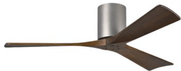
Shown in: Brushed Nickel / Walnut

The Atlas Irene Hugger Ceiling Fan is rustic yet strikingly modern, with cleanly joined solid wood blades and a minimal cylindrical motor housing. Its streamlined profile with the warm, natural look of wood works beautifully in contemporary and transitional spaces. Equipped with a DC motor, the fan is energy efficient and ultra-quiet. A hand-held remote control and wall control are included, both able to turn the motor on/off and set 6 speeds and forward/reverse. For fans that have a light, the controls also turn the light on/off and dims it. Fans that have a light include a cap matching the housing finish for no-light use. Note: Some combinations of motor finish, blade color, and light option are not available.