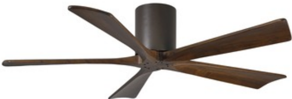
Shown in: Textured Bronze / Walnut

The Atlas Irene Hugger Ceiling Fan is rustic yet strikingly modern, with cleanly joined solid wood blades and a minimal cylindrical motor housing. Its streamlined profile with the warm, natural look of wood works beautifully in contemporary and transitional spaces. Equipped with a DC motor, the fan is energy efficient and ultra-quiet. A hand-held remote control and wall control are included, both able to turn the motor on/off and set 6 speeds and forward/reverse. For fans that have a light, the controls also turn the light on/off and dims it. Fans that have a light include a cap matching the housing finish for no-light use. Note: Some combinations of motor finish, blade color, and light option are not available.