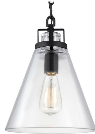
Shown in oil rubbed bronze / clear

The Frontage Pendant features a Satin Nickel or Oil Rubbed Bronze finish with a Pressed Clear glass shade. One 60 watt max 120 volt medium base bulb is required, but not included. Pressed Clear glass options ideally suited for vintage-style filament bulbs. 10 inch width x 13.25 inch height x 78.4 inch maximum length. 60 inch chain included. UL listed.