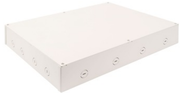
Shown in: White

The PSB-4X100W-ELV-24VDC Class 2 LED Power Supply accepts input voltage in a range of 120 volts AC and outputs 24 volts DC power up to 4x96 watts. The power supply can be used as a dimmable or non-dim power supply. Features short circuit and overload protection. Power Input: 120VAC, 50/60Hz. Power Output: Class 2, 24VDC, 4X4A, 4X96 watts maximum. For indoor applications only. To avoid overheating the power supply, install it in a ventilated remote location where air flows. Maintain proper spacing among power supplies when multiple power supplies are installed in the same remote location. Dimmable with an electronic low voltage dimmer (tested and approved: Lutron Diva DVELV-300P, Lutron Skylark SELV-300P, Lutron Maestro MAELV-600, Lutron Radio RA 2, or Legrand Adorne ADTP703TU, sold separately. ETL listed. 17 inch width x 13 inch depth x 3 inch height.