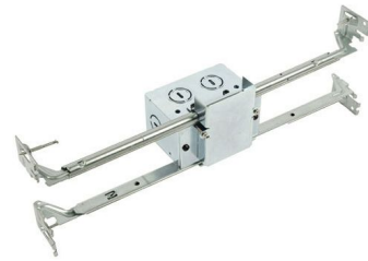
Shown in aluminum

Reveal Junction Box is included with End Feed Power Channel Connector. Mounts behind drywall with Adjustable Mounting Bars, and includes a drywall template for accurate installation. Low voltage 24VDC wires from remote power supply connect to LED wires inside box. Junction Box opening is concealed with the Reveal Junction Box cover. Junction Box is required at the beginning of each run. Designed for use with Pure Lighting Reveal channel product.