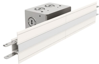
Shown in satin aluminum

TruLine .5A Center Feed Power Channel Connector allows 24VDC power to be fed from the center of the channel in one or both directions. LED Soft Strip (not included) may be installed flat or on side of the channel. Includes Lens, Channel Joiners, Junction Box, Adjustable Mounting Bars, Two 90 Degree Power Connectors, as well as Left and Right Power Connectors. Can be wired as a single or dual power feed. Designed for use with PureEdge Lighting Static White (and all other color temperature options except RGBW and RGBTW TruLine .5A plaster-in LED system.