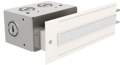
Shown in satin aluminum

TruLine .5A End Feed Power Channel Connector allows 24VDC power to be fed from the end of the channel. LED Soft Strip (not included) may be installed flat or on one side of the channel. Includes Lens, Channel Joiners, Junction Box, Adjustable Mounting Bars, and a 90 Degree Power Connector. Designed for use with PureEdge Lighting Satic White (and all other color temperatures except RGBW and RGBTW) TruLine .5A plaster-in LED system.