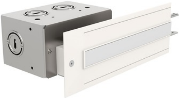
Shown in: Satin Aluminum

TruLine .5A End Feed Power Channel Connector allows 24VDC power to be fed from the end of the channel. LED Soft Strip (not included) may be installed flat or on one side of the channel. Includes Lens, Channel Joiners, TL.5A Junction Box, Adjustable Mounting Bars, and Channel Solderless Snap & Light Power Connectors. ETL listed. Designed for use with Pure Lighting TruLine .5A plaster-in LED system.