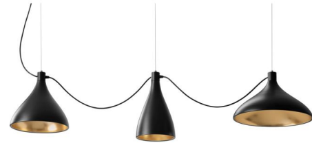
Shown in black / brass

PRODUCT DIMENSIONS . . . . . Adjustable Cable Length: 120" COLOR RENDERING . . . . . 82 CRI LAMP COLOR . . . . . 3000K LUMENS/WATT . . . . . 55.17 LUMINOUS FLUX . . . . . 800 lumens