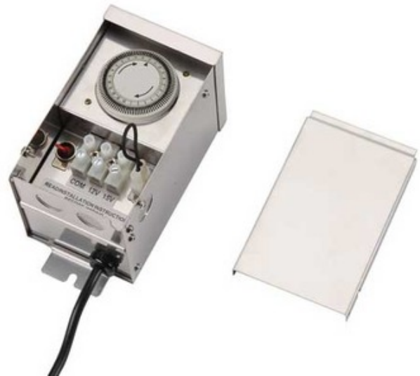
Shown in: Stainless Steel

Outdoor 12 Volt 75 Watt Remote Magnetic Transformer features a rain-tight stainless steel enclosure with hinged lockable cover and multiple knockouts throughout the bottom and sides. Input voltage: 120 volt. Output voltage: 12-15 volts. Maximum watts 75. Includes removable timer and field installed photocell, 6 foot outdoor line cord, and one low voltage circuit breaker protecting output circuit. Dimmable to 50 percent with a low voltage magnetic dimmer, sold separately. ETL listed. Suitable for wet locations. Lifetime warranty. 8.2 inch width x 3.7 inch height x 4.6 inch depth. For use with SPJ Lighting Forever Bright outdoor lighting products.