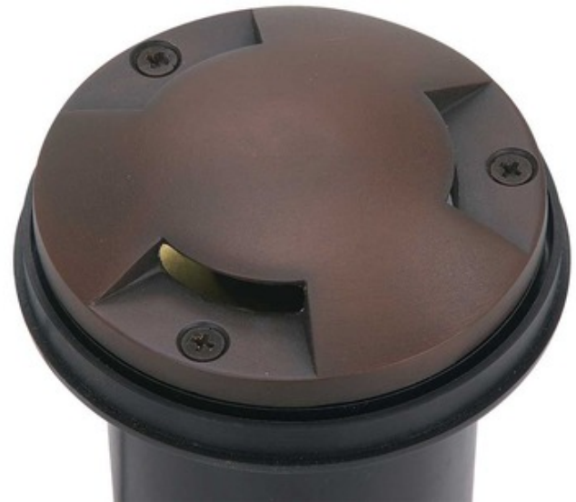
Shown in: Matte Bronze

13-300 Outdoor In Ground Marker Light is made of solid brass with etched finishes in Satin Brass, Verde, Rusty, Matte Bronze, Moss, Black or Aged Brass. Features clear tempered refractor lens with gasket. Includes 5 watt, 120 volt Nichia Forever Bright LED, 2700K color temperature, 125 lumens. Wide Angle Flood optic. 360 degree light distribution. Concrete pour sleeve required, sold separately. ETL listed. Suitable for wet locations. Made in USA. 20 year warranty. Dimensions: 4.5 inch diameter x 6 inch overall height. .875 inches above grade once installed.