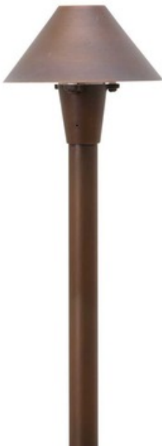
Shown in: Matte Bronze

MA-20 Outdoor Path Light is made of solid brass with etched finishes in Verde, Rusty, Matte Bronze, Moss, Black or Aged Brass. 1/2 inch NPT. Dual fin spike included. Suitable for wet locations. Made in USA. 20 year warranty. Requires magnetic transformer, sold separately.