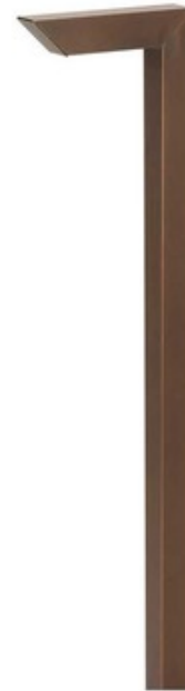
Shown in: Matte Bronze

SQ100-1 Outdoor Path Light is made of solid brass with etched finishes in Verde, Rusty, Matte Bronze, Moss, Black, or Aged Brass. Includes one 2 watt, 12 volt Nichia Forever Bright LED, 2700K color temperature, 125 lumens. .5 inch NPT. Dual fin spike included. ETL listed. Suitable for wet locations. Made in USA. 20 year warranty. Dimensions: 4.9 inch width x 21 inch height. Requires magnetic transformer, sold separately.