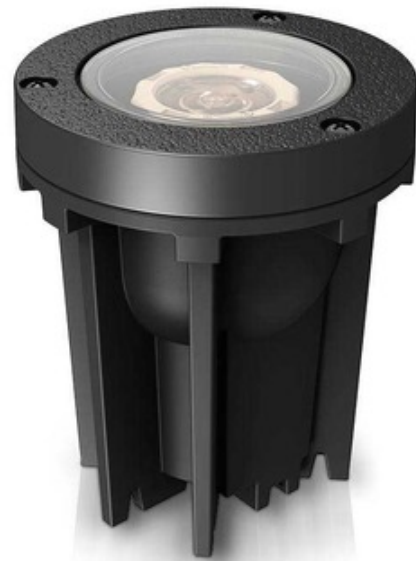
Shown in: Black

IL9 FlexScape LED Inground Luminaire is designed for optimal LED performance and superior flexibility. The luminaire creates visual interest for pathways, walls, columns and foliage. Its rugged injection molded housing installs directly into the soil. Features molded-in brass inserts for repeatable opening and closing, and lens ring secured with three screws that clamp lens and molded silicone gasket into place. Includes 10 watt single Luxeon M LED with choice of 3000K or 4000K color temperature, 70CRI, and 12 volt Class 2 driver with integral switch providing customer access to the adjustment between four light levels. Low iron tempered clear glass lens with molded gasket which slips onto lens without tools. Zoomable optic made of injection molded clear acrylic with select surfaces textured. Lens provides narrow 15 degree to medium 35 degree beam pattern, depending on the position, or wide 60 degree flood output. ETL listed for wet locations. IP67 rated. 5 year warranty. 4.11 inch diameter x 5.04 inch height. Requires 12 volt remote transformer, sold separately.